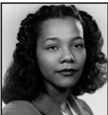
Mrs. King often cited her experience at Antioch as a seminal influence on the woman and the historic figure she was to become.

YELLOW SPRINGS, OHIO—"Antioch gave me an increased understanding of my own personal worth," she wrote in her 1993 edition of her autobiography My Life With Martin Luther King, Jr. "I was no longer haunted by a feeling of inadequacy just because I was an African American. Antioch -- the total experience of Antioch -- was an important element in preparing me for the role I was to play as the wife of Martin Luther King, Jr., and for my part in the movement he led," she continued.